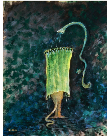
Theodor Seuss Geisel (1904 – 1991)