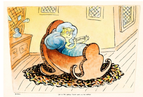
Cat in the Cradle Doing Cat's in the Cradle

(Authorized Estate Edition) High-Resolution Artwork Available on Request